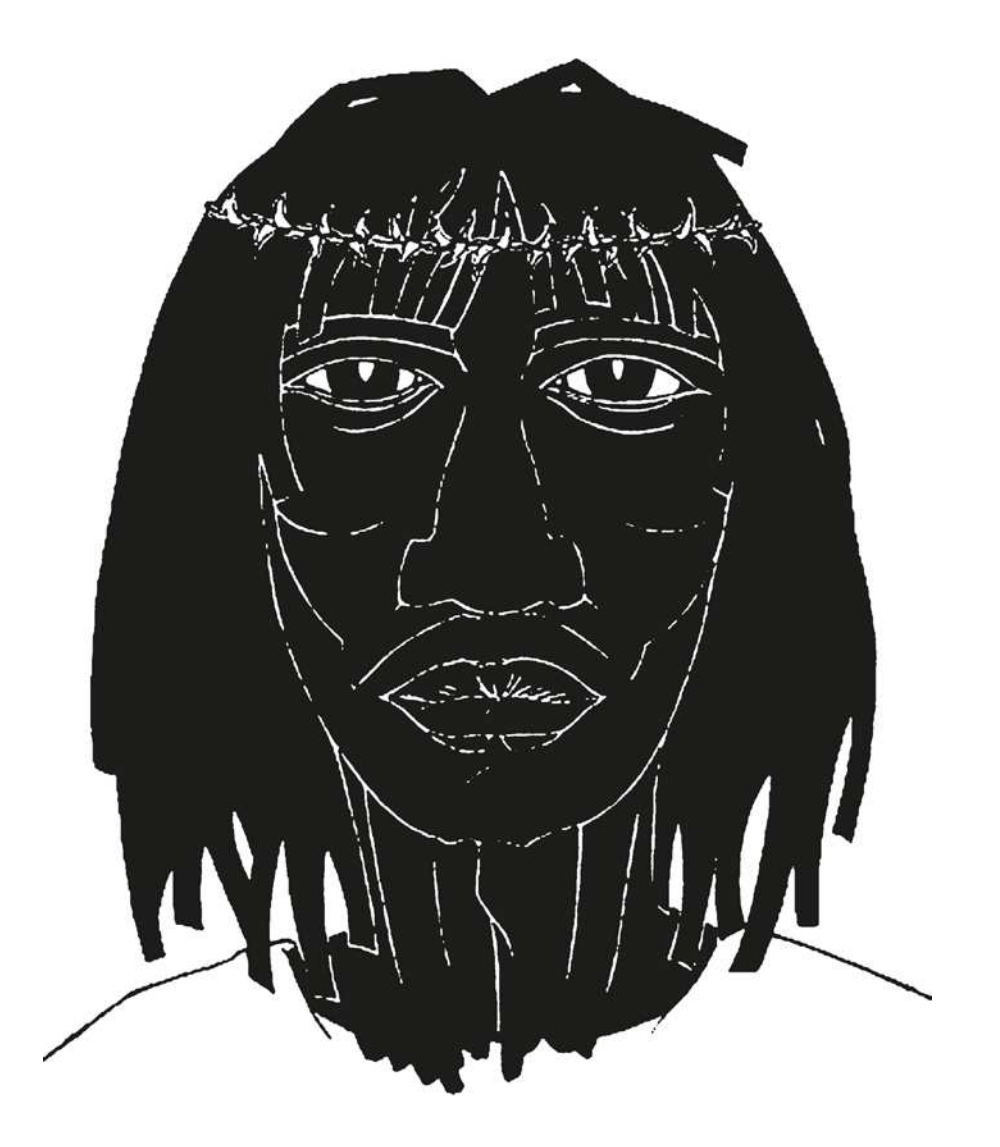
'Jesus as Dread'; The 'Dread' Christ is one who sides with all oppressed people in their struggle against anything denying them full humanity. From 'The Christ We Share' [USPG 2012]

I am completely convinced that if we are to be modelling the kingdom of heaven here on this earth, then we need to be passionate about intercultural living! It is not enough to just tolerate one-another, we need to be willing to enter each other's spaces. We need to be willing to be mutually inconvenienced. And when we do this, we start to create, together, a beautiful and larger story than perhaps what we started with!