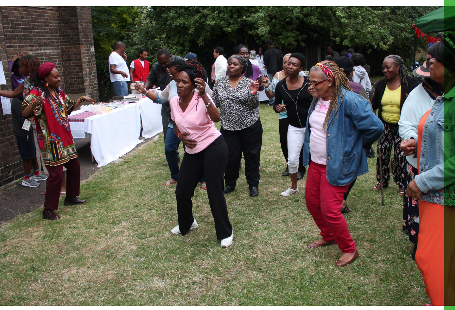
Black women at a charity event.

Creating racial justice requires action, while it is early days in Ireland and the wheels of culture could move ever so slowly, every little step will count. The action needs to be embraced by all the cross section of society if it is to be effective, as exemplified above.