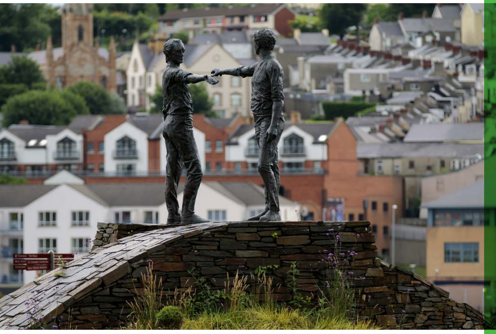
'Hands across the divide'; peace sculpture in Derry

we cling tightly to control of "how things are done" in Church, or do we look at it as a place where a diverse group of people, all image-bearers of God, gather to worship in ways that reflect their whole selves?