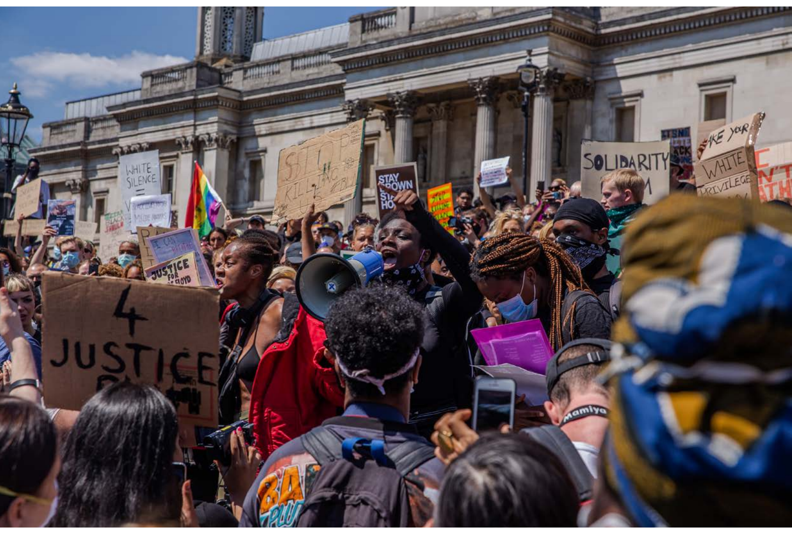
How should the church seek to engage Black Lives Matter?